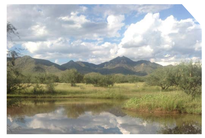
The unique natural landscape around Fort Huachuca creates an electromagnetically quiet area for the Buffalo Soldier Electronic Test Range; preventing development of up to 1,475 new wells on these lands conserves groundwater resources and grassland for cattle grazing.

Within this region a variety of local, state, and federal partners are working to reduce land and water development while preserving native grassland and ranches. Providing incentives and technical assistance to private landowners helps sustain a local way of life and ensures availability of scarce groundwater resources for the entire region. The Sentinel Landscape partners aim to prevent the drilling of up to 1,475 new wells to preserve water necessary for Fort Huachuca's operation and the continued health and existence of species on and off post. In addition, protected lands buffer over 160,000 annual air operations and reduce proliferation of electromagnetic interference for 800 square miles of air space.